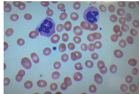
FIGURE 1: Hypersegmented neutrophils and hypochromic erythrocytes characteristic of a megaloblastic anemia. H&E stain. Magnification: 400x.

microangiopathies (TMA), autoimmune hemolytic anemia, drug-induced hemolysis (cephalosporins, dapsone, and levodopa), paroxysmal nocturnal hemoglobinuria (PNH), and other hereditary syndromes [13]. Vitamin B12 deficiency is not often associated with hemolytic anemia; however, upon literature review, there have been multiple cases with similar presentations [14] (Table 2). Vitamin B12 deficiency can cause hemolytic anemia most commonly via intramedullary hemolysis of immature reticulocytes; however, thrombotic microangiopathy is rarely seen [15]. Reticulocytopenia in cobalamin deficiency commonly reflects ineffective erythropoiesis in the setting of bone marrow involvement and intramedullary destruction as opposed to peripheral hemolysis as seen with TTP [15, 16]. This mechanism is initiated by premature death via hemolysis of the developing erythrocyte precursors in the bone marrow and is associated with the laboratory findings of hemolysis including elevated LDH, bilirubin, and decreased haptoglobin [16, 17]. However, very few cases of vitamin B12 deficiency have been linked with MAHA, and previous studies indicate that this may arise from acute hyperhomocystinemia which can lead to microangiopathic hemolytic anemia termed pseudothrombotic angiopathy [18]. Therefore, initial laboratory and pathologic findings can often mimic TTP in severe cases of cobalamin deficiency and in rare cases, such as ours, it can present with microangiopathic hemolysis.