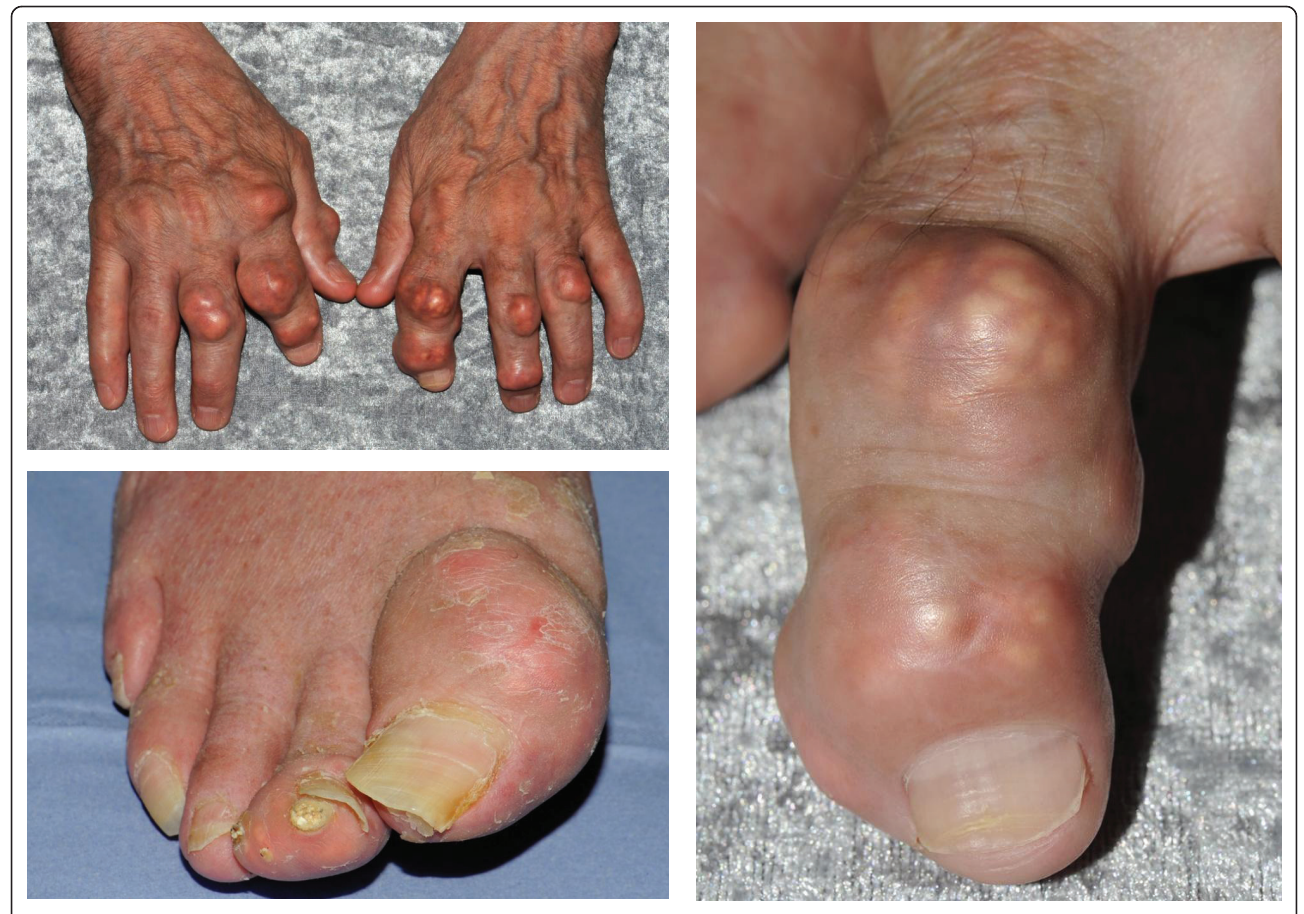
Figure 2 Tophaceous gout affecting the right great toe and finger interphalangeal joints. Note the asymmetrical swelling and yellowwhite discolouration.

hyperuricaemia and subsequently MSU crystal formation occurs [16,17]. Crystals are then shed into the joint and activate the inflammatory cascade via the NALP3 inflammasome [18,19]. Hence, any explanation of why gout targets the foot must link these pathological processes to the specific anatomical, functional, and disease characteristics of the foot (Figure 3).