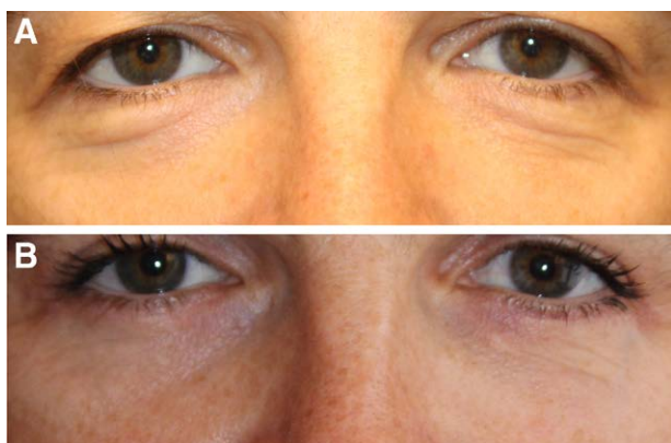
Fig. 3. Pre- and postoperative photographic evidence. A, A 40-year-old woman presented with no scleral show, a grade 0 snap-back test, a right eyelid distraction test of 6.9 mm, a left eyelid distraction test of 6.9 mm, a right eyelid skin excess of 3.3 mm, and a left eyelid skin excess of 3.1 mm. The left lateral canthus appeared slightly downslated with respect to the contralateral one. Orbital fat pads were herniated in both sides, more pronounced on the right. The patient underwent lower eyelid blepharoplasty through our technique. B, Six months postoperatively.