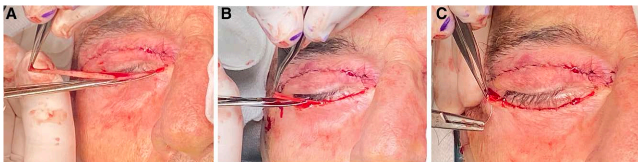
Fig. 1. Intraoperative photographs showing the technique for inferior eyelid blepharoplasty. A, Through a 2-cm-long myocutaneous incision made 1 mm below eyelashes to spare tarsal ligaments and extended laterally in Borges's lines and an incised septum with central fat pad identification, a complementary fashioned skin flap dissection was performed. B, A complementary fashioned preseptal orbicularis-muscle flap dissection limited within the lateral orbital rim to preserve orbicularis innervation was performed. C, Skin stitches are positioned in order to grasp skin-muscle-skin in an oblique fashion. This oblique vector puts the muscle into tension, compensating the horizontal skin laxity.

A total of 280 patients (bilateral eyelids) underwent successful lower blepharoplasty. There were 228 women (81.4%) and 52 men (18.6%), with mean age of 53.5 years (range, 31–69 years). Seventy-three patients had a history