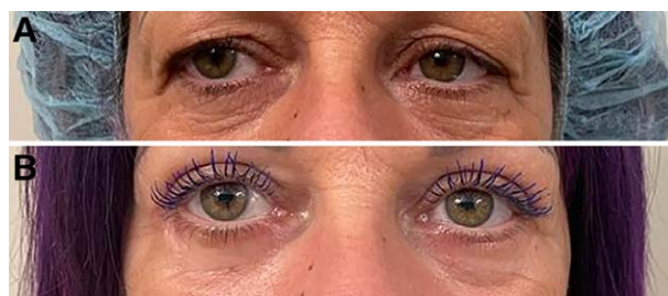
Fig. 5. Pre- and postoperative photographic evidence. A, Preoperative assessment of a 54-year-old woman who presented with no scleral show, a grade 2 snap-back test, a right eyelid distraction test of 7.1 mm, a left eyelid distraction test of 7.0 mm, a right eyelid skin excess of 8.6 mm, and a left eyelid skin excess of 7.5 mm. No asymmetry was assessed in the canthal position. Right orbital fat pads were more pronounced than left ones. Lower eyelid blepharoplasty was performed. B, Twelve-month postoperative results.

On the other hand, despite the presence of excessive tearing, dry eye is one of the most disabling conditions: tears cannot be adequately drained, flowing outside the visual organ, causing dryness. It is an important source of symptoms, as it is associated with red eye, “foreign body sensation,” blurred vision, mild to severe photophobia, and eye discomfort or pain, as well as the increased risk of corneal abrasion. Dry eye is the result of lid margin alteration, associated with an abnormal congruity with the eye bulb. This affects the function and shape of tear menisci, adversely affecting the tear film distribution and