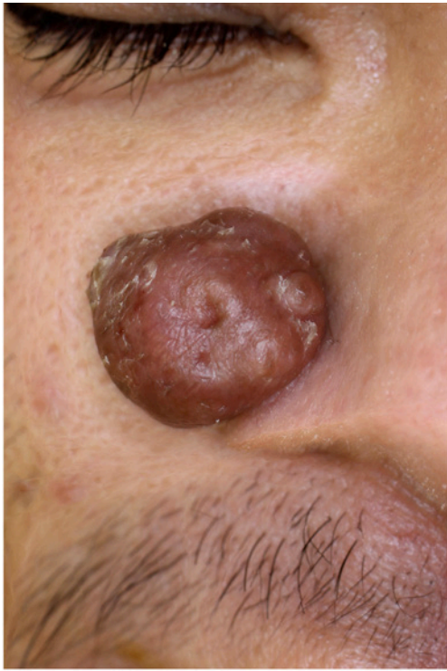
Figure 1. Clinical photograph showing a pedunculated reddish nodule on the nose.

of follicular, sebaceous, and mesenchymal components [1]. FSCH clinically manifests as a solitary skin-colored sessile or pedunculated nodule that is most commonly located on the central part of face, particularly on the nose or the paranasal area. The lesion is usually < 3 cm in size [2].