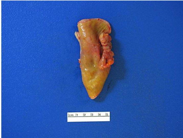
Fig. 2. Surgical resection identified the cause of the partial obstruction to be endometriosis.