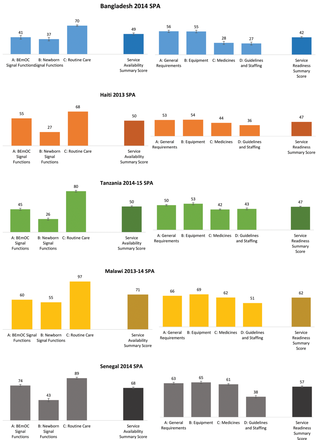
Figure 1. National service availability and service readiness summary scores, Bangladesh, Haiti, Tanzania, Malawi, Senegal. Confidence intervals are not shown for Haiti or Malawi, since those surveys were a census of all formal health facilities.

S6g in the Online Supplementary Document ). Overall, the summary scores for newborn care service readiness ranged from 42 in Bangladesh to 62 in Malawi.