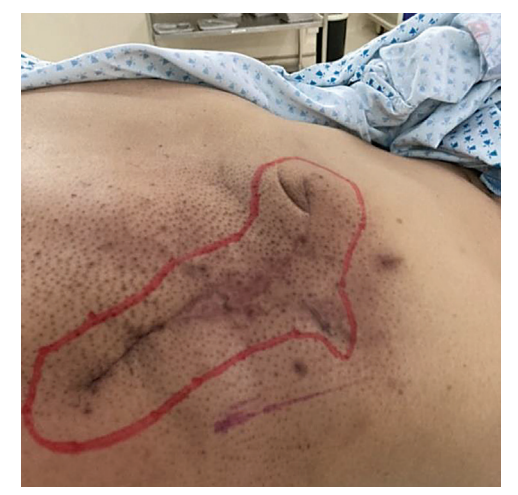
Figure 3. Hyperpigmentation with no desquamation over the right chest wall at the time of the scar boost.

Several risk factors for the development of male breast cancer have been identified; broadly, they can be categorized into genetic, disease-related, lifestyle-related, and occupational factors. A family history of breast cancer confers a relative risk of 2.53; 20% of men with breast cancer have a first-degree relative with the disease<sup>12</sup>. However, we note that our patient has no such family history, at least to his knowledge. Among women, 5-10% of breast cancers are posited to be due to autosomal dominant inheritance of BRCA1 and/or BRCA2 mutations.13 Among men, the figure is estimated to range from 4% to 40%. Specifically, male breast cancer is more significantly associated with BRCA2 than BRCA1 mutations.14 The role of genetics in male breast cancer is likewise evident among patients with Klinefelter's syndrome, a genetic disease characterized by the addition of at least one X chromosome to the normal XY karyotype in males. Clinically, it is exhibited by testicular dysgenesis, gynecomastia, hypotestosteronemia, and increased gonadotrophins. The risk of breast cancer in males with Klinefelter's syndrome is 20 to 50 times higher than their female counterparts.<sup>15,16</sup>