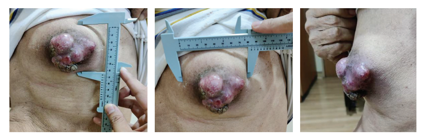
Figure 1. The 8.0 x 6.5 x 3.0 cm irregularly bordered, firm, fungating, nodular, nontender, nonmobile mass overlying the nippleareola complex of the left breast seen on initial consult.

Male breast cancer is a rare disease with potentially distinct biological and clinical differences compared to its more common female counterpart.<sup>1</sup> It accounts for less than 1% of all breast cancer cases<sup>2,3</sup>, less than 1% of all male cancers<sup>4-6</sup>, and less than 0.1% of all cancer deaths in men.<sup>7</sup>