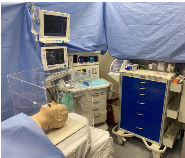
Fig. 2. Image of simulated operating room with aerosol box in position.

Finally, subjects were then instructed to clean the aerosol box in