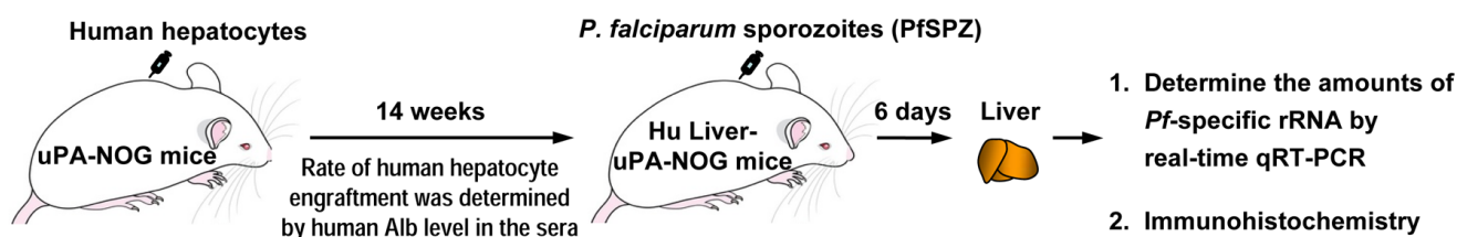
Figure 1. Schematic of the establishment of “humanised liver” mice and the evaluation of the infectivity of P. falciparum sporozoites in these livers. uPA-NOG mice were first engrafted with human hepatocytes. Twelve weeks later, engrafted, as well as intact uPA-NOG mice were challenged with PfSPZ. Six days after challenge, the livers were removed and subjected to real-time qRT-PCR assay and immunohistochemical analysis.

mouse (No. 2 in Fig. 2) had 1.5 mg/ml of human albumin in the sera (data not shown), indicating the rate of successful human liver engraftment to be 40% and 20% of the entire mouse liver, respectively (Fig. 2) [1]. One uPA-NOG mouse (No. 1 in Fig. 2) that did not receive the human liver engraftment and did not have any detectable human albumin in its serum, was used as a negative control. Fourteen weeks after the human liver engraftment, both engrafted mice, as well as the intact uPA-NOG mouse were challenged intravenously with aseptic, purified, cryopreserved, PfSPZ produced at Sanaria Inc. at the dosages of 1.2 \times 10^5 to 3.6 \times 10^5 PfSPZ per mouse. One uPA-NOG mouse engrafted with human liver and one intact uPA-NOG mouse were injected with 1.2 \times 10^5 PfSPZ, and 3.6 \times 10^5 PfSPZ were administered to another uPA-NOG mouse engrafted with human liver (Fig. 2). The one uPA-NOG mouse having human liver at 20% of the whole mouse liver was not inoculated with PfSPZ. Six days after injection with PfSPZ, we collected the liver from the infected and non-infected mice, and performed two different assays, as indicated in Fig. 1.