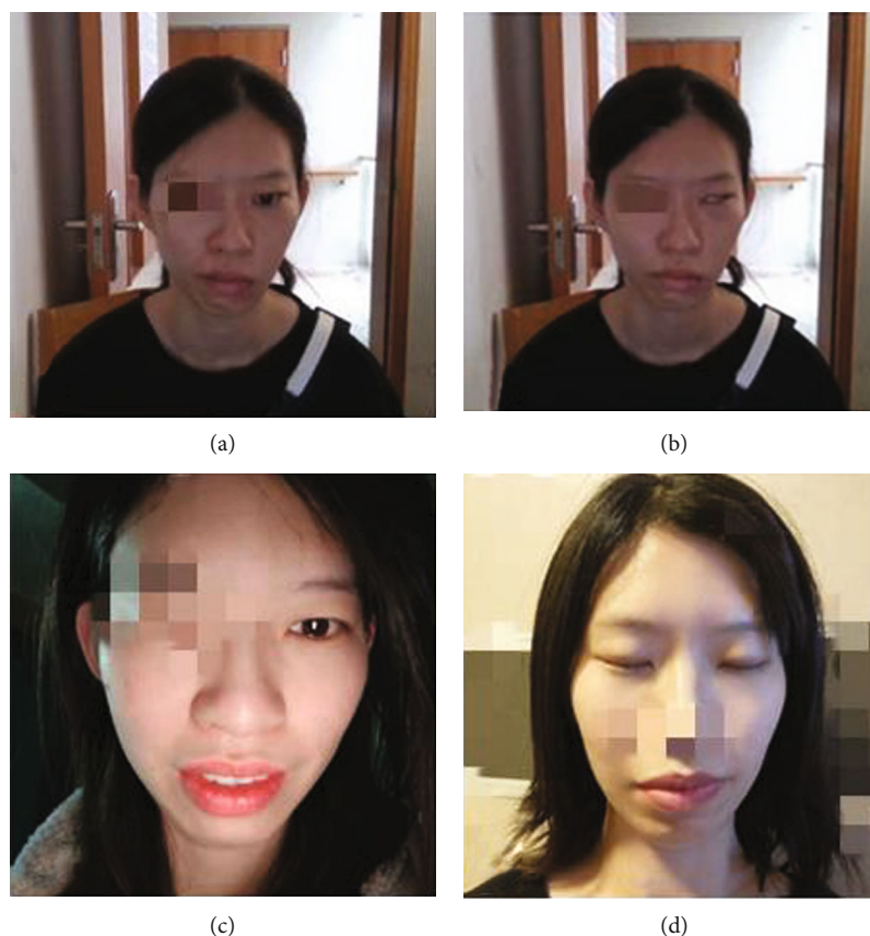
FIGURE 4: A patient before and after rTMS treatment: (a) and (b) represent the state of open and closed eyes at admission, and (c) and (d) represent the state of follow-up after discharge after rTMS treatment.

significantly skewed to the right (a and b). After 2 weeks of rTMS treatment, the patient's eyes were significantly closed and nearly normal (c and d).