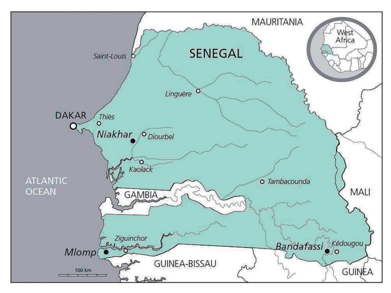
Figure 1. Location of Mlomp and the two other HDSS sites in Senegal.

The site is in a Guinea savannah and mangrove ecological zone. The area has a rainy season from June to October and a dry season from November to May, and had average annual rainfall of 1250 mm over the period 1985–2010.