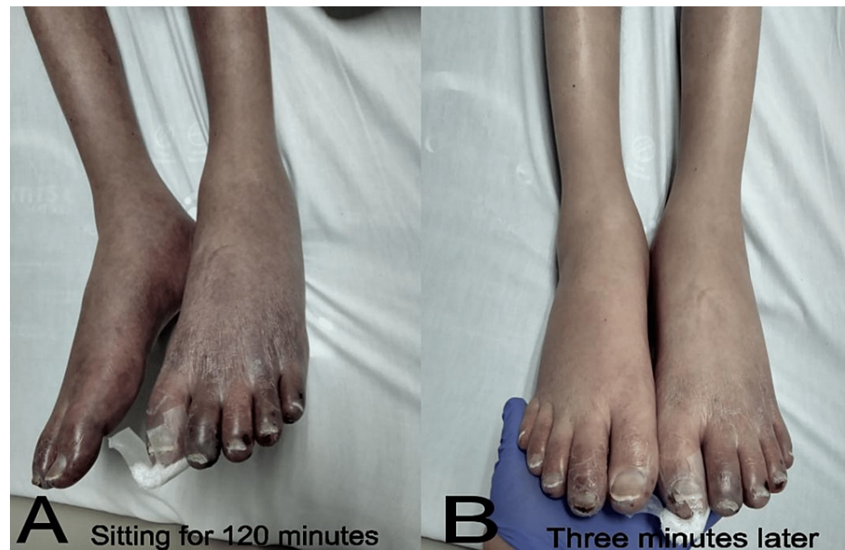
FIGURE 3: (A) Patient's lower extremities supine at the bed immediately after sitting for 120 minutes, showing deep purple discoloration. (B) After the legs were extended for three minutes, there was a significant improvement in the discoloration.

A computer tomographic scan and angiography of lower extremities showed no evidence of arterial narrowing, obstruction, or identifiable masses. The computer tomographic scan and angiography of the chest and abdomen revealed scattered atherosclerotic plaques on the abdominal aorta and mild narrowing of the celiac trunk without significant stenosis. The comprehensive metabolic panel, complete blood count, and platelet count were within normal limits. The D-dimer test was normal. The toxicology screen was negative. The patient had negative antinuclear antibody test, anti-ds DNA, anti-Scl-70, anti-beta-2 glycoprotein 1, anti-smooth muscle, anti-mitochondrial, anti-cardiolipin, antineutrophil cytoplasmic antibody test, and serum cryoglobulins. Inflammatory markers C3, C4, and rheumatologic factor were negative. Blood cultures were negative. Hepatitis B antibody, hepatitis C antibody, S-antigen, Mycoplasma pneumoniae Immunoglobulin M (IgM), HIV test, and COVID-19 antigen were all negative. Tests were negative for protein S, protein C, antithrombin III, factor V Leiden, and lupus anticoagulant. A portable ultrasound bedside evaluation revealed adequate arterial blood flow on both lower extremities (right ankle-brachial index = 0.95 and left ankle-brachial index = 1.47). There was no evidence of deep vein thrombosis or venous obstruction. A bedside echocardiogram showed no evidence of vegetations and no atrial or ventricular thrombi.