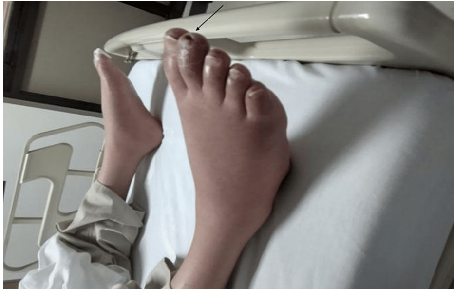
FIGURE 1: The patient's lower extremities supine on the bed show no skin discoloration. Thickened scaly skin of distal feet with scabbing at the tips of some toes is noted (black arrow).

Evaluation with the legs hanging off the bed showed visible blue/purple discoloration on the distal lower extremities with swollen feet. Changes in skin color were evaluated in a seated position for two hours. The changes in the skin color were symmetrical, and the arterial pulses remained normal during the examination. At 15 minutes, the skin color became darker, and the discoloration started just above the ankles and extended to both feet. At 60 minutes, the bluish discoloration darkened and progressed through the entire length of the leg, associated with mild pitting edema. At two hours, the feet and most of the legs appeared deep purple (Figure 2).