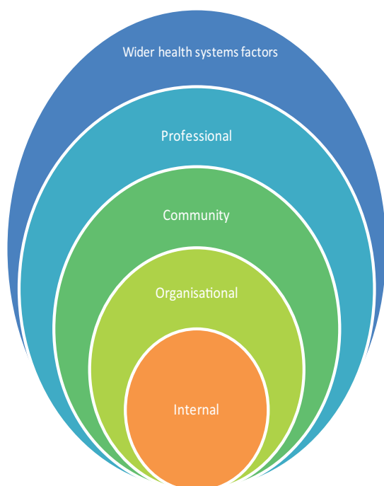
Figure 1. Adapted framework used to aid analysis. 25

this power differential, but reported seeking constructive relationships and aiming to set mutually acceptable targets. However, commissioners stressed they were accountable for public funds, and required providers to show continuous improvement by setting targets involving concrete changes in activity: ‘Our focus is more on what are we getting for our money’ (Commissioner, Site 4).