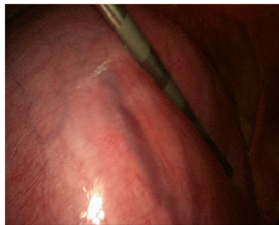
Fig. 1 Laparoscopic view of uterine myoma. The whole pelvic cavity is filled by the uterine myoma with a maximum diameter of 17 cm

She was offered laparoscopic removal of the myoma. Pneumoperitoneum was achieved using a supraumbilical Veress needle until an intra-abdominal pressure of 12 mmHg was reached. We first placed a midline supraumbilical 10 mm port for the telescope, and then two 5 mm accessory trocars were positioned in the left and right lateral quadrants visualized via a 10 mm telescope inserted through the supraumbilical port. The left and right accessory ports were inserted lateral to her deep inferior epigastric arteries and higher than usual; the accessory trocars were inserted sufficiently high enough to provide an unobstructed passage to the myomas for the laparoscopic instruments. Intra-abdominal visualization revealed an enlarged, lobular uterus containing a fundal intramural myoma with a maximum diameter of 17 cm, as diagnosed by ultrasound (Fig. 1). The adnexa on both sides, round ligaments, and