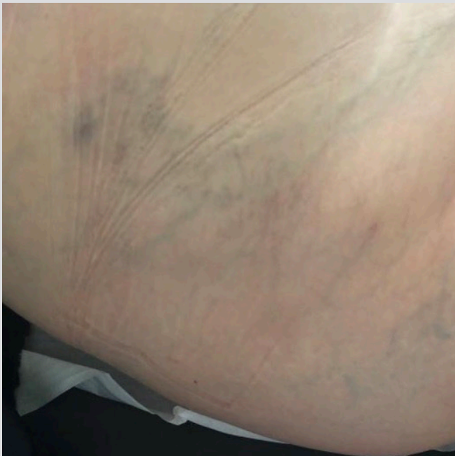
Figure 1. Abdominal wall and right thigh showing venous collateral circulation

At admission to our institution, the patient presented with a tympanic temperature of 37.8°C, peripheral oedema, the ecchymoses already described, abdominal wall venous collaterals ( Fig. 1 ), an inability to walk due to low back pain in the supine position (numeric pain intensity scale - 10/10), with no neurological deficits or decreased muscle strength.