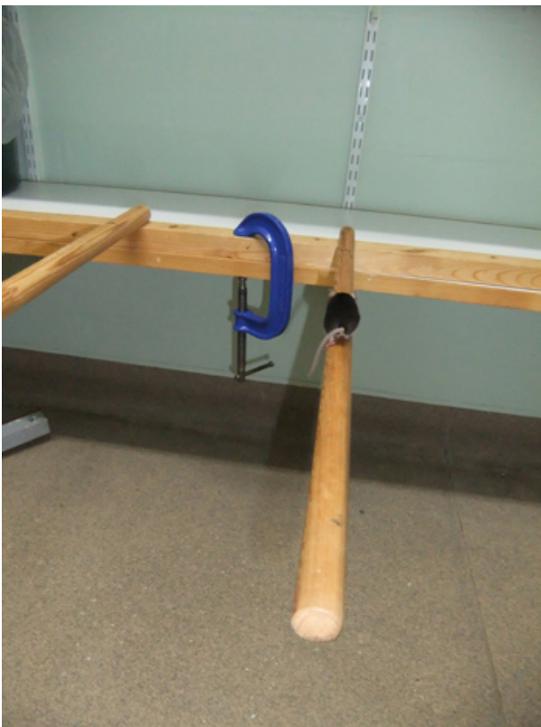
Figure 4. A mouse traversing a static rod.