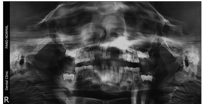
Figure 1: Preoperative orthopantomogram showing peripheral giant cell lesion in the left maxilla

Surgical excision and curettage were performed for two peripheral lesions under local anesthesia, whereas one central lesion was excised under general anesthesia. Adjacent teeth were scaled to remove local irritants. Two CGCG lesions were treated with a nonsurgical approach using intralesional corticosteroid. Medical conditions precluding the use of steroids were ruled out before therapy. A standard protocol [9] recommended in the literature was followed. Weekly injections of a mixture of equal parts of triamcinolone acetonide (Kenalog 10; 10 mg/ml) and local anesthetic (Xylocaine; 2% lignocaine hydrochloride with 1:200000 epinephrine) were used for 6 weeks. Response to treatment was assessed through: increasing difficulty of needle penetration into the lesion, back pressure felt while injecting solution, decreased swelling and pain, accompanied by increasing radiopacity visible on radiographs, and lesion regression.