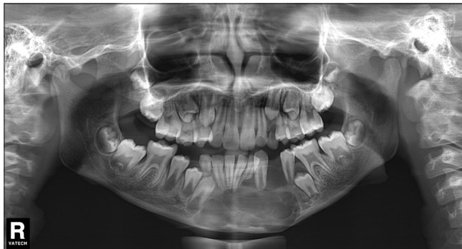
Figure 2: Preoperative orthopantomogram showing radiolucent central giant cell granuloma of the mandible crossing the midline

In all cases, a provisional diagnosis of giant cell granuloma was made on the basis of history and clinical examination. The serum calcium, phosphate, alkaline phosphatase, and parathyroid hormone (PTH) levels were undertaken to eliminate hyperparathyroidism in all cases. The histologic examination for patients 1 and 2 [Table 1] showed a nonencapsulated mass of tissue compiled of a fibrillar connective tissue stroma containing fibroblasts, multinucleated giant cells, blood vessels and hemosiderin pigmentation, suggestive of PGCG [Figure 5]. Histologically,