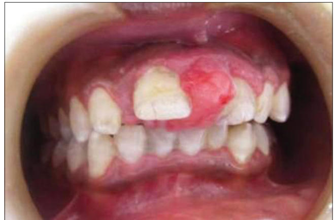
Figure 3: Preoperative photograph showing peripheral giant cell granuloma lesion in relation to teeth number #11 and 21 [37]

A total of 5 GCG were identified in this case series, of which 2 cases were diagnosed as PGCG and 3 cases as CGCG. PGCG lesions occur more than 2 times more