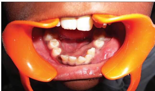
Figure 4: Preoperative photograph showing central giant cell granuloma lesion in relation to teeth numbers #33–42

for cases 3 through 5 [Table 1], cellular connective tissue stroma with numerous multinucleated giant cells, blood capillaries, bony trabeculae with osteocytes in lacunae, and mild lymphocytic infiltrate was seen on hematoxylin and eosin stained sections, suggestive of CGCG [Figure 6].