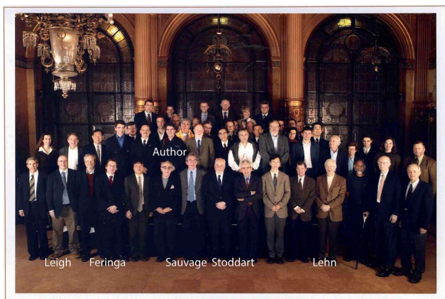
Fig. 4 Participants of the 21 st Solvay Conference on Chemistry "From Noncovalent Assemblies to Molecular Machines", Brussels, Hotel Métropole, 30 November 2007.