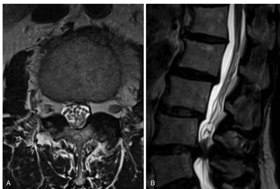
Figure 1. Lumbar magnetic resonance image of redundant nerve root syndrome (RNRS). Both axial (A) and sagittal views (B) show tortuosity and redundancy of nerve roots.

Patients were divided into 2 groups, those with RNRS: Group R, and those without RNRS: Group C. For each patient, the LESI initially performed after the date of the MRI was considered the beginning of the study. Patients who complained of both low