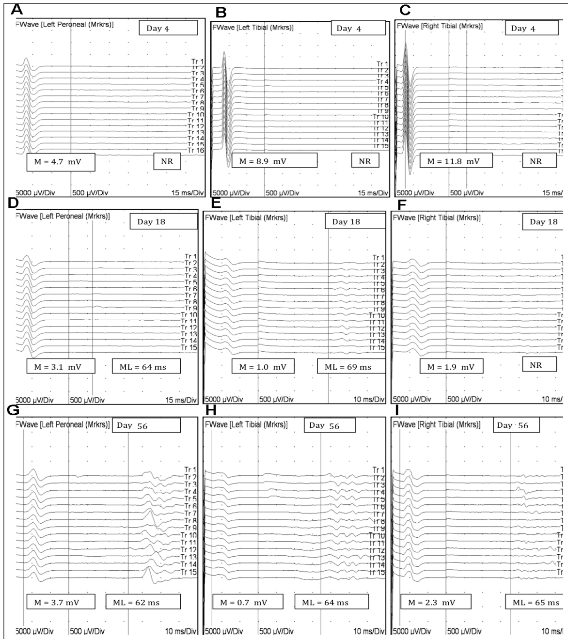
Figure 2- F-waves (a-c) F responses recorded by stimulating the left peroneal and bilateral tibial nerves at day 4, (d-f) day 18, and (g-i) day 56 after disease onset. M - direct motor response; ML-minimal latency; mV - millivolt, NR - no response; ms - millisecond

to the non-traumatic spinal cord infarct described in novice surfers (surfers myelopathy). In such cases, the postulated mechanisms of ischemia include transient arterial compression during a prolonged back hyperextension in the setting of poor collaterals, vasospasm or thrombosis of the artery of Adamkiewicz, and avulsion of perforating blood vessels. 4,5 The