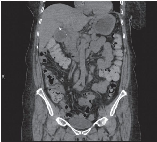
Figure 2. Abdominal CT (coronal view) shows a dilated duodenum and narrowing in the descending duodenum (arrow). There is a 2.2 x 1.6-cm soft tissue postbulbar mass, which is located between the descending duodenum and the pancreatic head, creating the postbulbar obstruction. Fine needle aspiration of the mass at endoscopic ultrasound revealed adenocarcinoma.

also showed adenocarcinoma. Gastrojejunostomy was performed to bypass the gastric outlet obstruction. Neoadjuvant chemotherapy with folinic acid, fluorouracil, and oxaliplatin was started for duodenal adenocarcinoma. After 4 cycles of chemotherapy, she underwent a Whipple procedure. The pathology report indicated an adenocarcinoma of the pancreas with extension into the duodenum and metastasis to the adrenal gland and 1 lymph node. Final pathology interpretation was pancreatic adenocarcinoma T3N1M1.