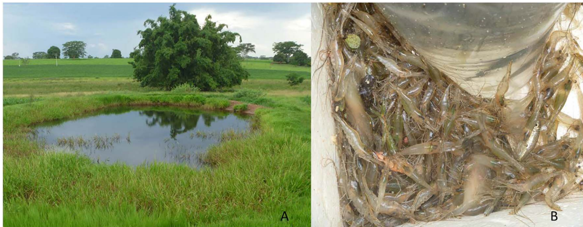
Fig. 3. Permanent breeding place for culicids (A). Population of shrimps release at the breeding ground (B).

These variables were analyzed using the chi-square test ( \chi^2 ) or the Fisher's exact test (Zar, 1999), using the SAS program (SAS,