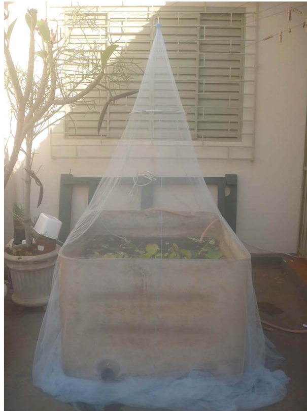
Fig. 2. Tank covered with anti-mosquito devices for assessing the number of larvae that reached the adult stage.

for adult culicids were installed at the site (day zero). After, the shrimps were released in the breeding sites, proceeding with the quantification of larvae and adult insects in these areas every 24 h for three days using the technique of entomological shell. In these areas, the capture of the adult forms of mosquitoes was carried out with the use of human bait and CDC trap (Fig. 4). At the end of 30 days a new collection was performed. The main method of observation of the impact of the release of shrimps on the environment was the quantification of the larvae and pupae of culicidae in the breeding grounds before and after the presence of crustaceans, as well as the population of mosquitoes caught in the traps installed in the environment.