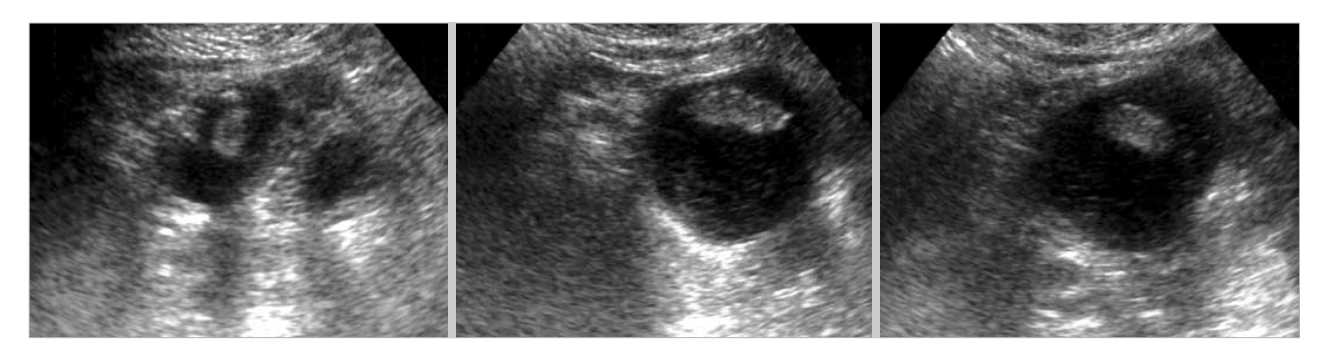
Fig. 2. Gallstones were identified within the dilated bowel as floating hyper-echoic foci producing distal acoustic shadowing reflections, which moved when the patient's position was changed.