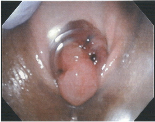
Figure 1 Cystoscopy showed a pedunculated, reddish, 2 cm sized mass on external urethral meatus at the 6 o'clock position.