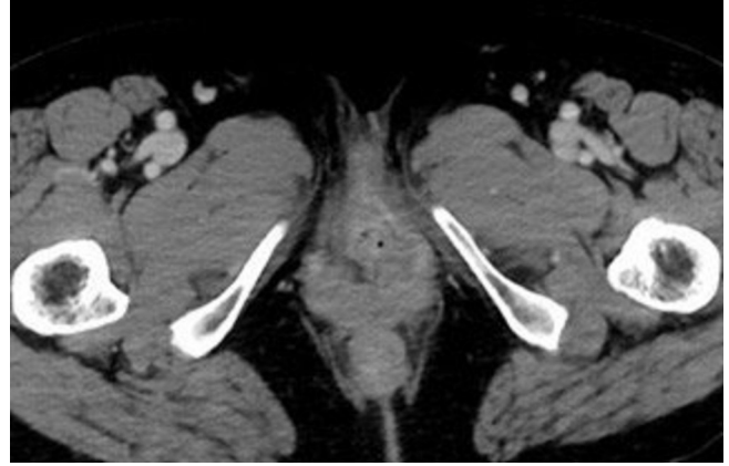
Figure 3 CT image of the pelvis with administration of contrast agent showing a 2 cm sized mass which appeared located on the urethral meatus.