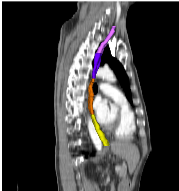
Figure 1 Sagittal section illustrating delineation of the cervical esophagus (pink), the upper thoracic esophagus (purple), the mid-thoracic esophagus (orange), and the lower thoracic esophagus (yellow).

generated. The esophageal dosimetric parameters of the entire esophagus and subsites were extracted from the dose data set in the treatment-planning system including volume, mean dose, and the percentage of the volume of esophagus receiving 10 Gy ( V_{10} ) to 60 Gy ( V_{60} ) (Figure S1).