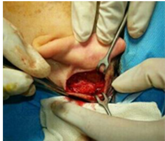
Fig. 1: Harvesting fibroareolar tissue from post-auricular region.

The exclusion criteria included any previous lip augmentation via injectable and/or surgical fillers in the lips, perioral skin resurfacing and any history of esthetic procedures of the nose, jaws, or anterior teeth. All surgeries were performed by a single surgeon. The graft was harvested from the post auricular loose fibro areolar tissue via post auricular approach. After intravenous sedation or general anesthesia, local anesthesia was accomplished through 5 mL of 2% lidocaine and 1:100,000 epinephrine. then a C-shape incision was made by the number 15 scalpel blade in the postauricular sulcus (Figure 1).