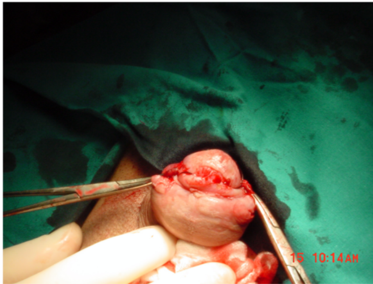
Figure 1 The ulcerated lesion in the ventral portion of the coronal sulcus.

cystic shape (Figure 2). The lesion was widely excised; an intraoperative pathology examination revealed an epidermoid cyst. The inner prepuce was then reconstructed. The postoperative course was uneventful and our patient was discharged on postoperative day 1. A final histological examination showed a cyst lined by a layer of stratified squamous epithelium with a keratin-filled lumen, thus confirming the final diagnosis of epidermoid cyst of the penis (Figure 3). No recurrence had occurred at nine years of follow-up.