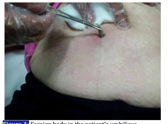
Figure 1: Foreign body in the patient's umbilicus

The results of laboratory tests upon the patient admission were as follows: White blood cells (WBC)=11210 /mm<sup>3</sup>, hemoglobin=12.5 gr/dl,