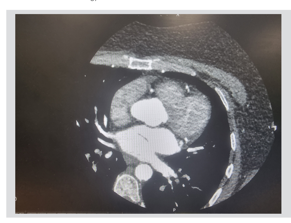
Figure 2. CT angiogram showing a non-obstructive membrane in the left atrium from the intra-atrial septum to the venous ostium with no thrombus

in the upper left atrium with no thrombus. Given the poor compliance with warfarin, off-label apixaban 5 mg twice a day was started after discussion with Haematology.