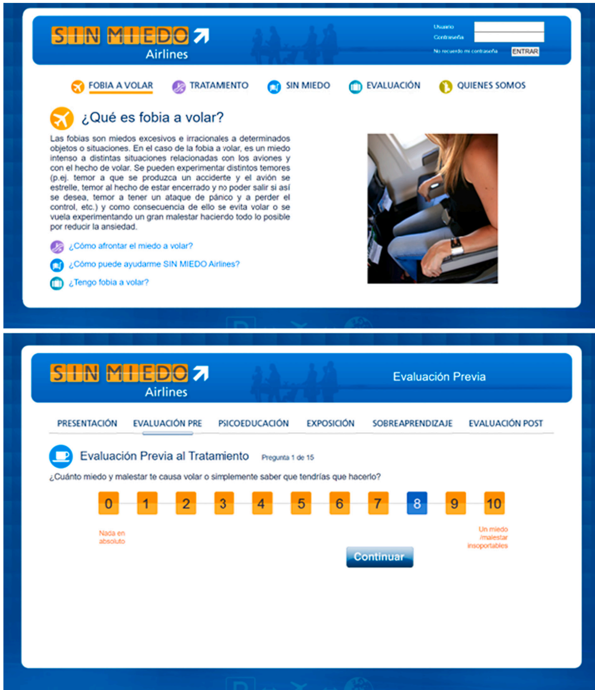
Fig. 1. NO-FEAR Airlines screenshots.