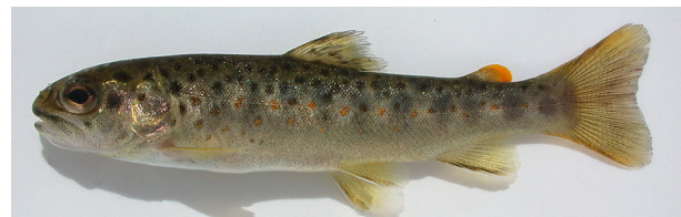
Figure 1. Juvenile non-native brown trout ( Salmo trutta ) in South Africa.

We studied tributaries of the Keiskamma (Eastern Cape Province), the Thukela, and the uMgeni (KwaZulu-Natal Province) Rivers in South Africa. The surrounding area of all of the sites is characterized by indigenous forest and grassland. We sampled 12 sites across six streams in November 2013 (Keiskamma streams: Cata, Mnyameni and Gwiligwili) and April 2014 (Thukela and uMgeni streams; Sterkspruit, Mooi and Lotheni). Five of the streams have been invaded by trout to different degrees and the sixth (Gwiligwili) was used as an un-invaded reference site. Within each stream, we sampled above and below a fish barrier (waterfalls >2 m), and therefore, our sites represented upstream fishless and downstream fish sites. Stream characteristics were standardized across the