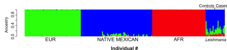
Fig 1. Population structure analysis. Genome wide SNPs (299,411) were used to calculate the individual ancestry proportion of the “ Leishmania ” group, assuming the three principal ancestral populations ( K = 3 ). Green bars correspond to EUR (individuals with European ancestry), blue bars correspond to individuals with Native Mexican ancestry and red bars labeled as AFR correspond to individuals with African ancestry. The last block on the far right labeled “ Leishmania ” corresponds to the 9 controls and 10 cases used in this study. The X axis represents individual references for each population and the Y axis represents the ancestry proportion for each individual in a scale from 0 to 1 (colors included in each bar). The block labeled as Leishmania shows that all samples are essentially Mexican-mestizo.

It has been reported that L. major LPG induces NF- \kappa B nuclear translocation as well as TNF- \alpha and IFN- \gamma cytokine production in healthy controls [1]. In order to verify if this phenomenon was also present at gene expression level, LPG-stimulated (LPG) versus non-stimulated (NS) NK cells from: healthy controls, LCL and DCL samples were analyzed. Results show that in the Control group (C), no genes were found to be significantly down-regulated, whereas 8 genes