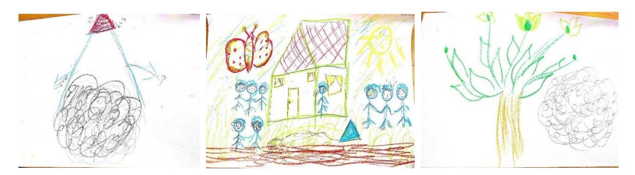
Figure 1. Selecting a new sheet of paper as the format for the integrative drawing.

With regard to the stress drawing in Example 1 (drawing at far left in Figure 1), the MHP explained her drawing as follows: "I drew the emotional turmoil that I have been experiencing because of my concern over the safety of my family, including my children and grandchildren, family friends who are in active duty military service during the war, and my clients and staff members". These three groups of people are displayed in the three vertexes of the triangle that appears in the drawing, with the clients and staff members placed at the upper vertex, as noted in the words added to her drawing. With regard to the resources drawing (drawing at the center in Figure 1), the MHP noted the following: "I drew my home and family members, which I view as a major resource enabling me to better cope in stressful situations". With regard to the integrative drawing (drawing at the right in Figure 1), the MHP stated that "The drawing expresses my lessened feelings of emotional turmoil".