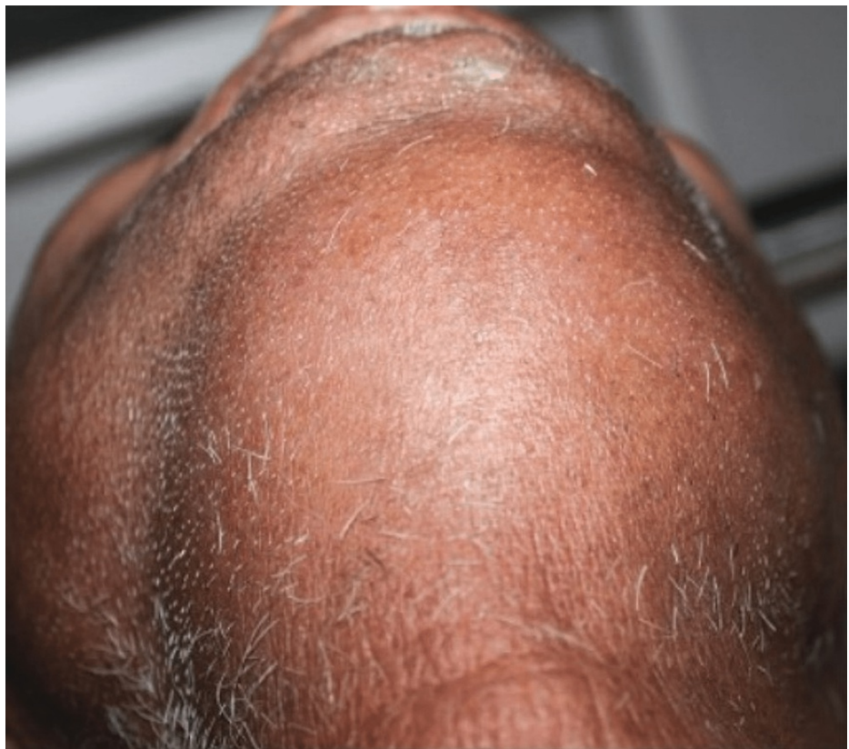
FIGURE 2: Preoperative neck view

Physically toxic, his vital signs were immediately monitored after a physical examination. A 100°F body temperature, 96 BPM pulse, a blood pressure of 120/70 mmHg, and 22 breaths per minute respiration were all present, and only allowed for a 1.5 cm mouth opening (interincisal distance). The submandibular and sublingual regions on both sides were involved in the extra-oral swelling, which was indurated and non-fluctuant (Figure 2).