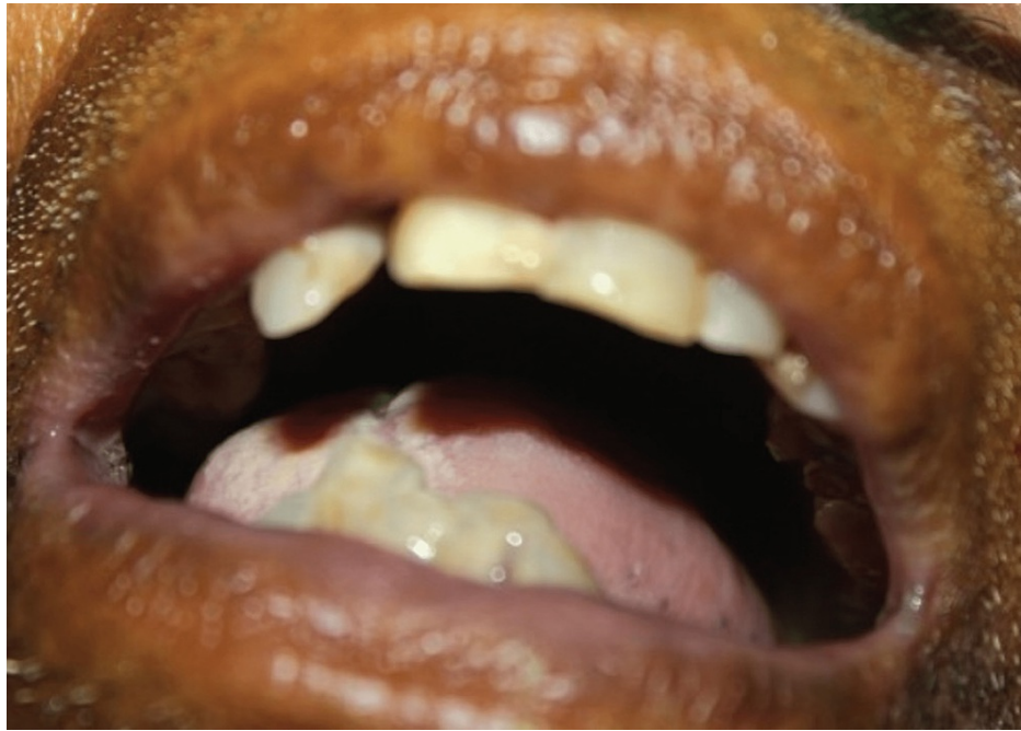
FIGURE 3: Preoperative mouth opening

Three days previously, an infected third molar had been removed. Ludwig's angina was diagnosed right away, and the patient was scheduled for surgical decompression under awake fiberoptic intubation and tracheostomy as a standby as they allowed for a 1.5 cm mouth opening (interincisal distance) (Figure 3).