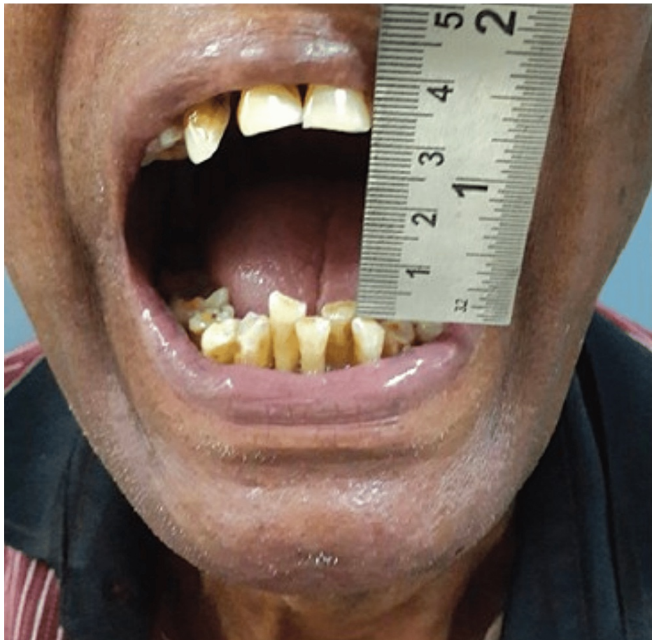
FIGURE 6: Postoperative mouth opening