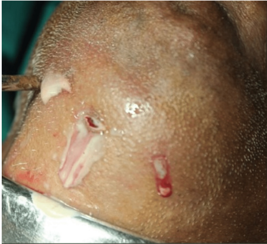
FIGURE 5: Draining pus

The vital signs were stable during surgery. As a final reversal for any residual neuromuscular inhibition, 0.05 mg/kg of neostigmine was given. Due to periglottic oedema, the trachea was not extubated. Instead, the patient was moved to a post-anaesthesia care facility. While the endotracheal tube was still in place, the patient is placed on a T-piece, and 5 litres of oxygen were administered per minute. Sedation was produced by combining midazolam and fentanyl. The patient had a pulse rate of 75 beats per minute, a blood pressure measurement of 110/70 mmHg, and an oxygen saturation level of 97% the next morning. The neck oedema had diminished. A thorough oral suction was followed by extubation of the trachea. Although oedema had subsided and there was no cause to predict airway problems, the fibroscope was kept on standby. As a result, no elaborate tracheostomy or analogous procedure preparations were made. Following that the extubation went without an issue (Figure 6). The patient was discharged four days later [2].