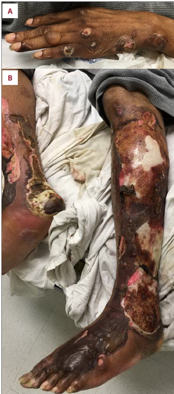
Figure 1. (A) Left hand: roofed and unroofed partial and full thickness blisters. (B) Both legs and feet: roofed and unroofed partial and full thickness blisters.