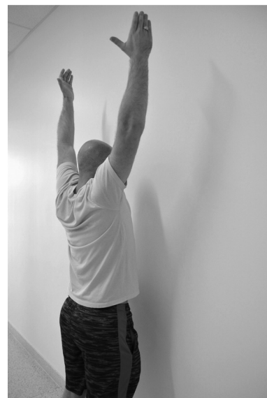
Fig. 2. Scapular standing facing a wall. Y's while.