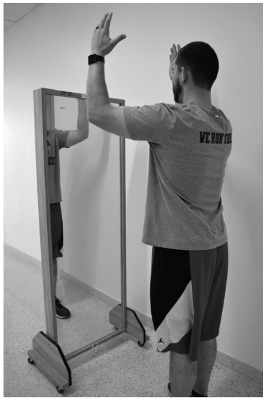
Fig. 3. Scaption fly's with elbow flexed to 90 degrees in front of a mirror.