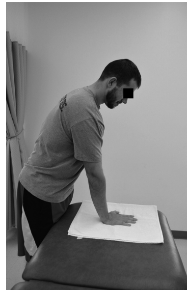
Fig. 4. Wax on/wax off.

1). The 15.2% represented a clinically significant change, obtaining the MCID range of 13.2% to 15.4% 24, 26 ). The patient's overall score on the QuickDASH decreased from 61.0% at baseline to 29.5%. This 31.5% reduction exceeds the MCID range by 2 to 3 times (MCID 9–11.3%) 30, 31 ).