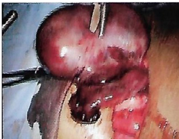
Fig. 3 Twisted gangrenous right ovary

Adult and adolescent patients with OT present with typical clinical features. The younger the patient, the more non-specific the features become. Diagnosis becomes more and more challenging for the treating clinician, especially in a resource-limited setting. Our patient presented with clinical and initial biochemical investigation findings of a urinary tract infection with a negative urine culture proving it to be an aseptic pyuria. Although aseptic pyuria has been reported in adolescent cases, this case reiterates the importance of investigating younger patients with aseptic pyuria further for the possibility of