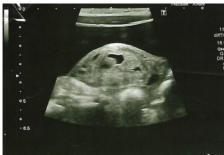
Fig. 1 Hyperechoic mass on the pouch of Douglas on right side measuring 5 cm × 2.5 cm × 3 cm suggestive of ovarian cyst

After 36 hours, gentamicin was stopped and she was started on intravenous cefotaxime 50 mg/kg/dose every 6 hours and intravenous metronidazole 7.5 mg/kg/dose every 8 hours for 5 days.