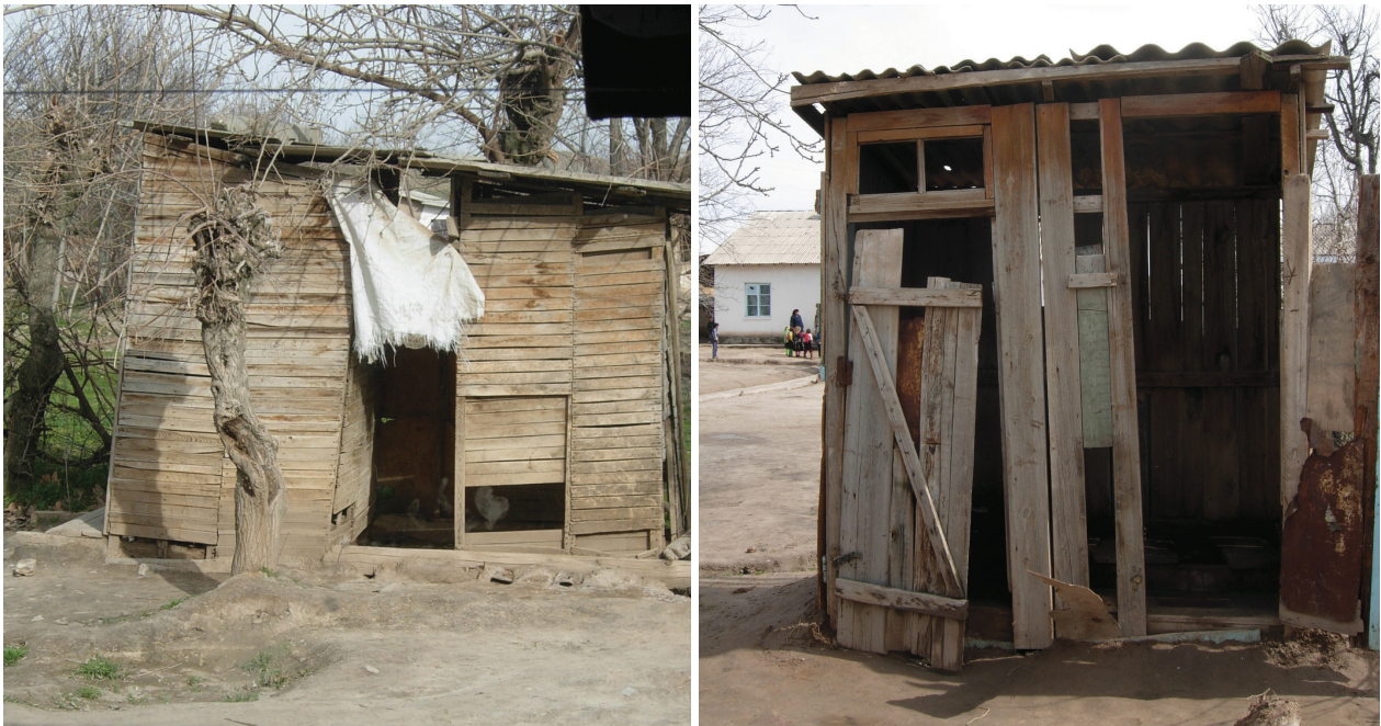
Figure 2 School latrines in two primary schools in western Tajikistan, early 2009.

Unmet drinking water and sanitation standards in Tajikistan partially result from weak services of water supply and public sanitation. Only 23% of the population had access to a sewage system in 2003; 89% in urban areas but only 11% in rural areas [6]. Thus far, active participation mechanisms in water management involving public and private sectors and local communities are poorly developed [6,43].