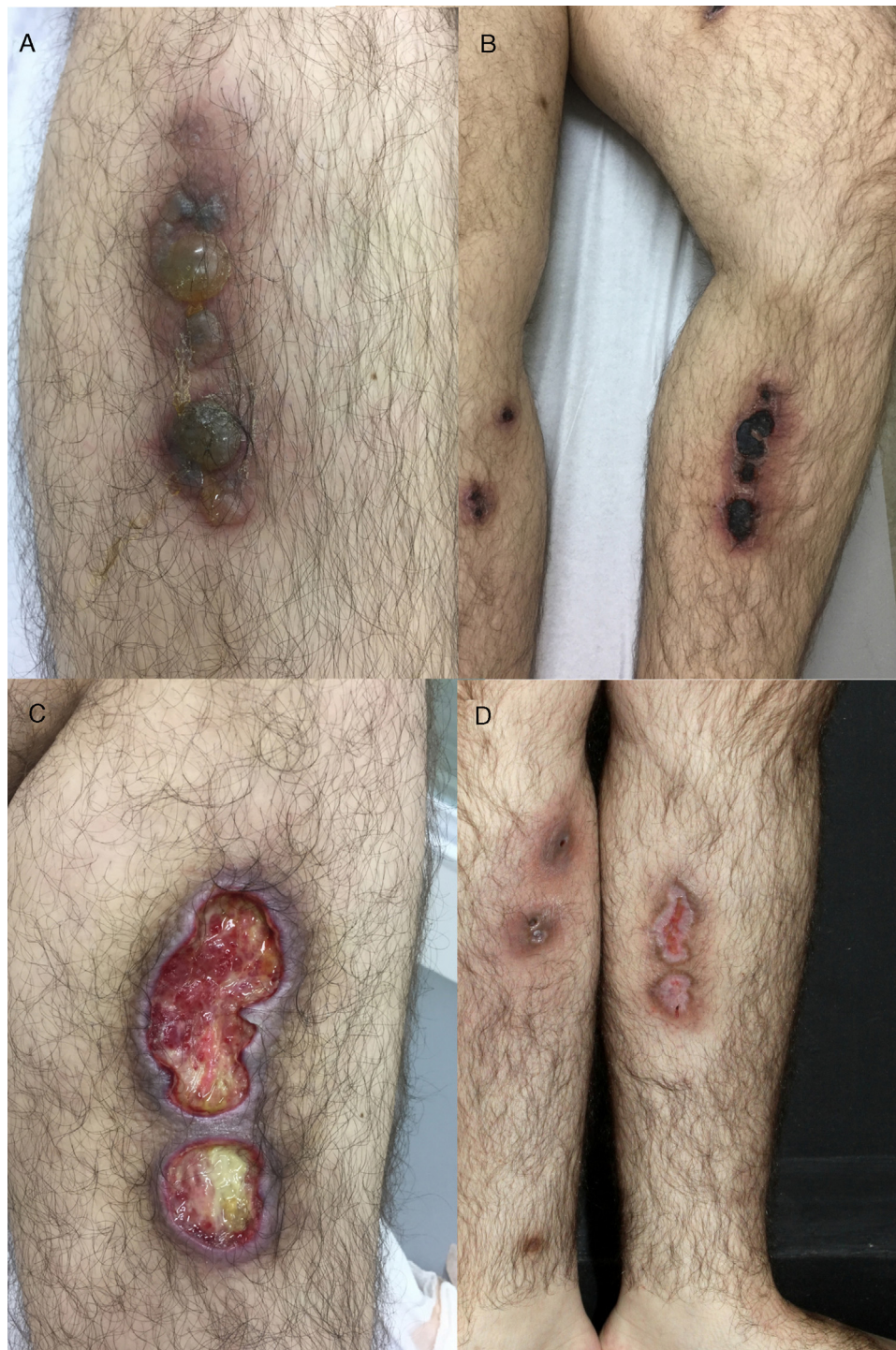
Figure 1 – (A) Deep infiltrated lesions with tense blisters on the surface; (B) after starting therapy with acyclovir, lesions became necrotic and ulcerated covered with an adherent black eschar; (C) lesions evolved to extensive deep ulcerated areas; (D) three months after initiating therapy, almost complete healing with residual atrophic scars.

treated with oral tetracyclines and topical antibiotics with the presumptive diagnosis of erythema nodosum; no improvement was seen. Two months later, the deep infiltrated lesions started to develop tense blisters on the surface (Fig. 1A). The patient had no signs of extracutaneous involvement. The complete blood count was normal (hemoglobin 13.7 g/dL,