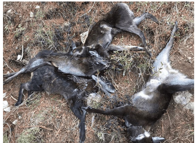
FIGURE 2 Musk deer killed in snares in Sagarmatha NP during COVID-19 lockdown

The Assistant Warden of CNP Mr. Rishi Ranabhat reported that the park faced extreme pressure of illegal activities during the first month of lockdown. The wild animals were freely roaming inside the