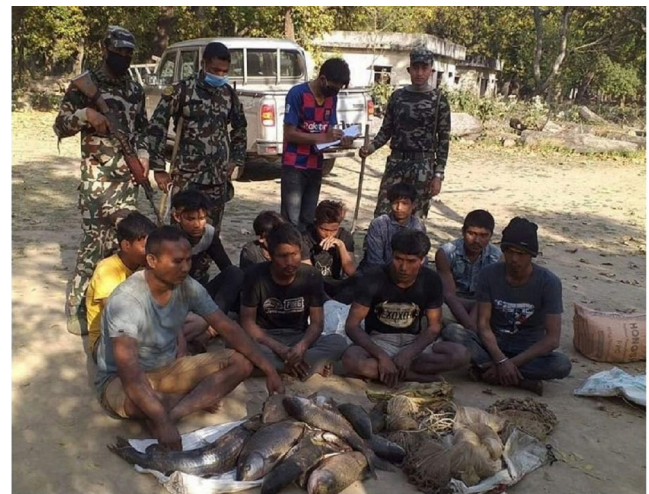
FIGURE 3 A group of people arrested by the patrolling team with a gill net and illegally caught fish during lockdown