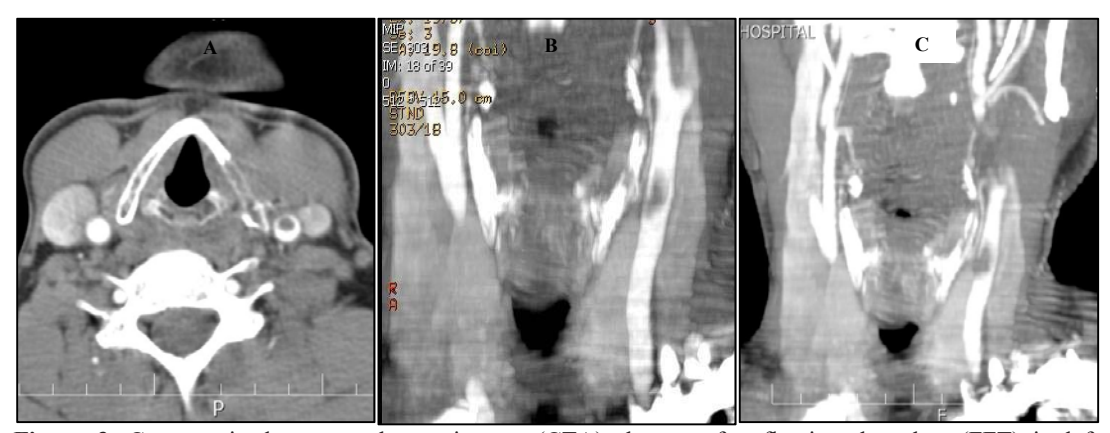
Figure 3. Computerized tomography angiogram (CTA) shows a free-floating thrombus (FFT) in left common carotid artery (CCA) attached to medial intima (donut sign) (A), mural attachment of clot (B), and mural attachment plus distal floating part of thrombus (finger sign) (C)

FFT is defined as an elongated thrombus attached to the arterial wall with circumferential blood flow at its distal most aspect with cyclical motion relating to cardiac cycles. Internal carotid artery (ICA) stands for the most prevalent site of thrombosis, 75 percent of all cases. CCA and carotid bifurcation are the next (7%). A wide range of incidence rate, 0.05 to 1.45 percent, has been reported so far with a male predominance and younger age group.1 Several overlapping pathologies are implicated to be the cause of FFT including intraluminal thrombus, thrombus, plaque thrombus, or mobile thrombus. It is said that atherosclerosis and hypercoagulate state are the leading etiologies of carotid thrombus formation.<sup>1</sup> But, as mentioned sparsely other reported causes are literature, hyperfibrinogenemia, iron deficiency anemia and thrombocytosis, stimulant drugs, carotid aneurysms, arterial dissections, malignancy, paradoxical embolization through a patent foramen ovale (PFO), and meningioma.<sup>2-5</sup>