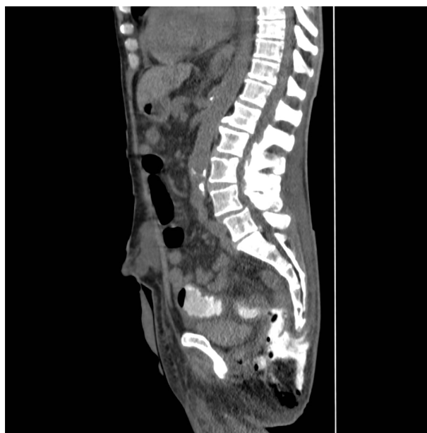
Figure 1 Computed tomography image with contrast, sagittal section, of pelvis, showing the fistula from the subcutaneous abscess cavity of the right buttock to the small intestine.