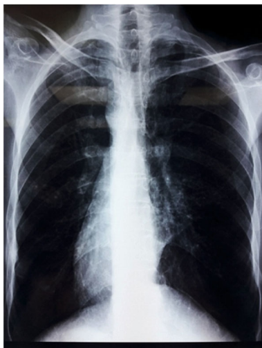
FIGURE 1: Chest X-ray showing dextrocardia.

Enhanced abdominal computed tomography (CT) has confirmed the situs inversus and showed a bulky mass in the right kidney, measuring 7 cm × 8 cm (anterolateral and craniocaudal) with cystic patches and multiple images of thickened septa (Figure 2). There were no tumor thrombus in the renal vein or the inferior vena cava.