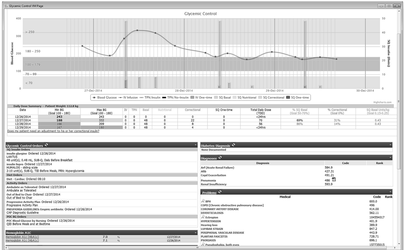
Figure 2 Glycaemic control clinical chart. Comprehensive visual summary of patient glycaemic control clinical data within the Electronic Health Record with links to evidence-based insulin order sets. Visible patient data included: diagnosis, haemoglobin A1c (HbA1c) level, diet orders, insulin orders, point of care testing orders and a graphical representation of units and time of insulin administrations and blood glucose values.

period itself and the postintervention sustainability period (1 September 2013 to 31 December 2014). The data were assessed graphically using statistical process control charts, and analysed with segmented time series regression with Prais-Winsten correction for autocorrelation.