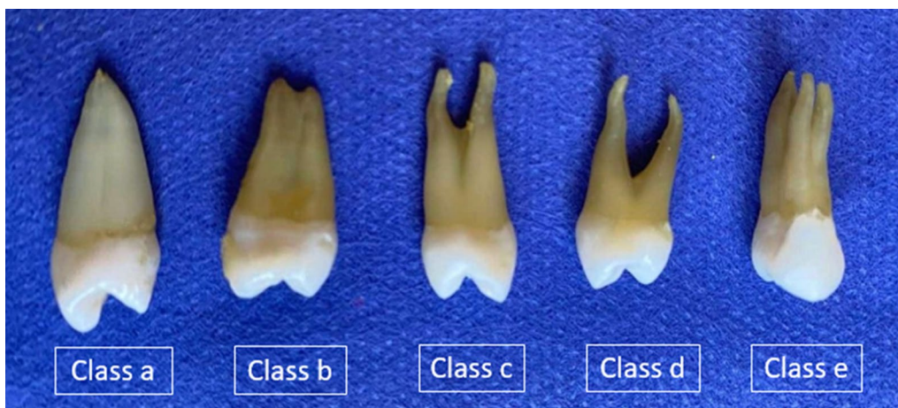
Fig. 1 Diagrammatic representation of the morphology, number, and different classes of maxillary premolar root