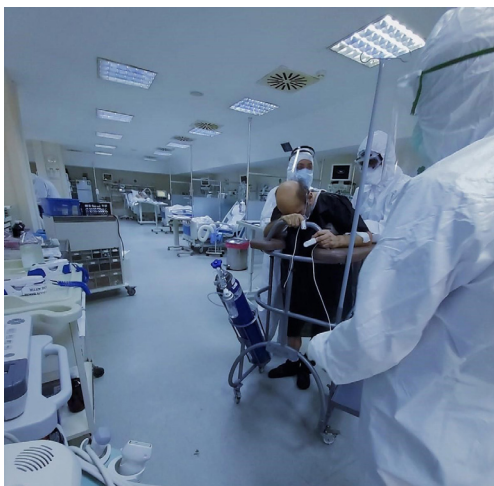
Figure 2 Award winning photograph taken in the intensive care unit in Cerrahpasa Medical Faculty Hospital during the pandemic. Photo source: archive of SARWALKER, special walker designed by the author. Permission to use was granted.

Many courses, meetings and multidisciplinary symposiums were either postponed or later switched to virtual-only events. Colleagues interacted with one another online, seminars became webinars. Courses became impractical.