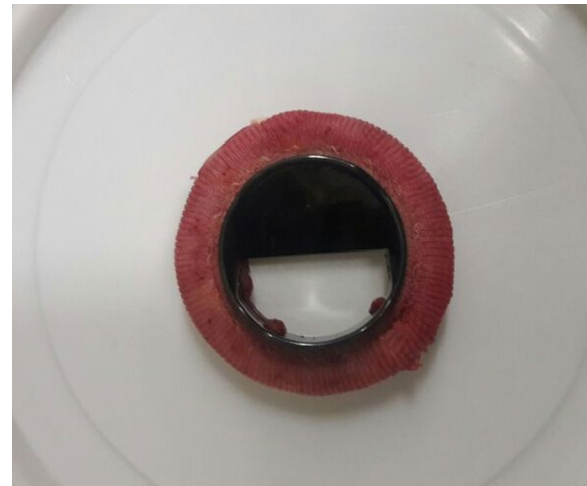
Fig. 3 The explanted mechanical mitral valve prosthesis On-X with a single leaflet

a single leaflet with normal mobility. The second leaflet was not visualized, and a working diagnosis of a stuck mitral valve prosthesis in a closed position was made. The patient underwent emergency redo mitral valve replacement. Intraoperatively on exploring the mitral valve prosthesis, a single leaflet was noted, and there was no pannus or clot formation (Fig. 3). The second leaflet was missing. The missing leaflet was not found inside the heart nor in the chest on an intraoperative transoesophageal echocardiogram. The valve was excised, and a size 25 mm On-X was implanted. We decided to reimplant the On-X valve because we could not find the literature