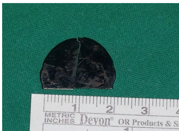
Fig. 5 The fractured and embolized leaflet extracted from the aorta and external iliac artery

an initial diagnosis. We suspect that the valve fractured first and then embolized as it was in 2 pieces. However, the report did not conclusively support this theory. Gobel et al. reported the first fatal case of leaflet escape with the On-X valve in the aortic position. Kayegama et al. and Amoros Riviera et al. reported two cases of On-X mechanical mitral valve leaflet fracture and embolization [3, 4, 6]. The site of embolization reported was the