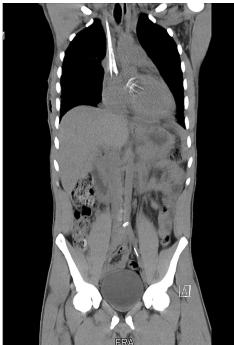
Fig. 4 Computed tomography of the whole body showing the mechanical mitral valve leaflet at the abdominal aortic bifurcation and left external iliac artery