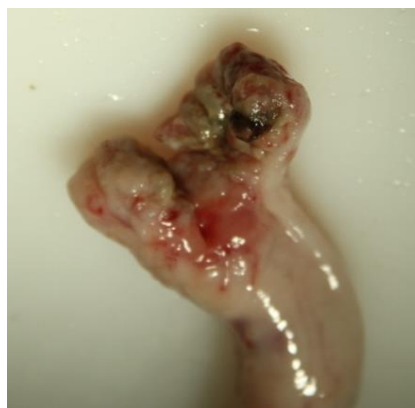
Figure 7. Specimen with partial loss/necrosis (DB).

For the first examinations at the experimental farms, a lesion score was created to summarize the number of major lesions (scars and wounds) on the Glans penis for each animal. Animals were assigned to the following injury score classes (without any = 0, one to three = I, four to six = II, seven to 10 = III, more than 10 = IV) to evaluate the number of lesions (scars and wounds) on the penis. In addition, the size of the major injury per penis and severe injuries (either larger than 1 cm, in combination with suppuration, or losses of a part of a penis) were recorded. Abrasions of the Glans penis, which point to sexual activity but may not be relevant for welfare, were also registered (Figure 7).