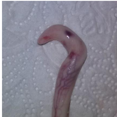
Figure 8. Specimen with hematomas and injuries (WB).

All examples shown in Figures 1–7 were derived from the study in domestic boars (experimental and commercial farms), and examples 8 to 10 shown in Figures 8–10 were from wild boars.