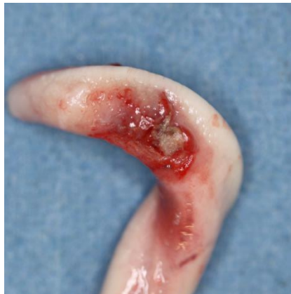
Figure 6. Specimen with severe injury (DB).

For the first examinations at the experimental farms, a lesion score was created to summarize the number of major lesions (scars and wounds) on the Glans penis for each animal. Animals were assigned to the following injury score classes (without any = 0, one to three = I, four to six = II, seven to 10 = III, more than 10 = IV) to evaluate the number of lesions (scars and wounds) on the penis. In addition, the size of the major injury per penis and severe injuries (either larger than 1 cm, in combination with suppuration, or losses of a part of a penis) were recorded. Abrasions of the Glans penis, which point to sexual activity but may not be relevant for welfare, were also registered (Figure 7).