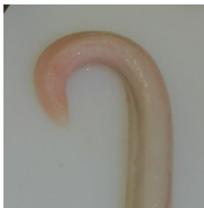
Figure 1. Specimen without injuries (DB).

Animals with an extruded penis after scalding revealed typical artifacts, especially incinerations due to singeing, and were excluded from the study. In the other animals, the preputium was removed by gentle manual pushing of the penis in a caudal direction within the preputium, so that the preputial sheet could be dissected without affecting the Glans penis or the Pars libra. In pre-pubertal animals or barrows, the adhesion between the preputium and penis via the frenulum was strong and it was not possible to move the penis freely within the preputial sheet. This observation was also recorded. After removing the preputium from the Pars libra penis, each sample was evaluated to see whether lesions and injuries (Figure 1), scars (Figure 2), open wounds due to biting (Figure 3) or severe injuries (Figures 4 and 5) or suppurations (Figure 6) could be detected.