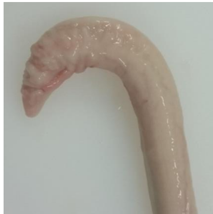
Figure 2. Specimen with multiple scars (DB).