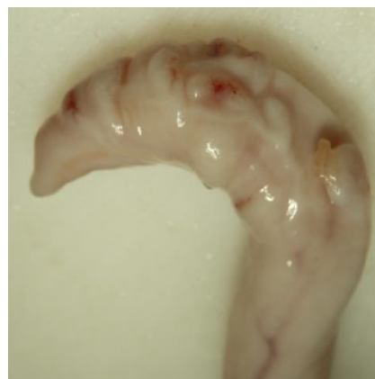
Figure 4. Specimen with suppuration (DB).