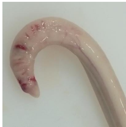
Figure 3. Specimen with fresh injuries (DB).