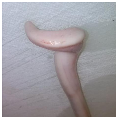
Figure 10. Specimen with thickening of and lesions at the ridge due to sexual activity in a WB.