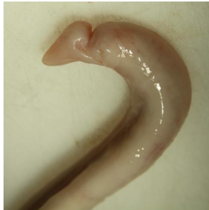
Figure 5. Specimen with partial loss (DB).