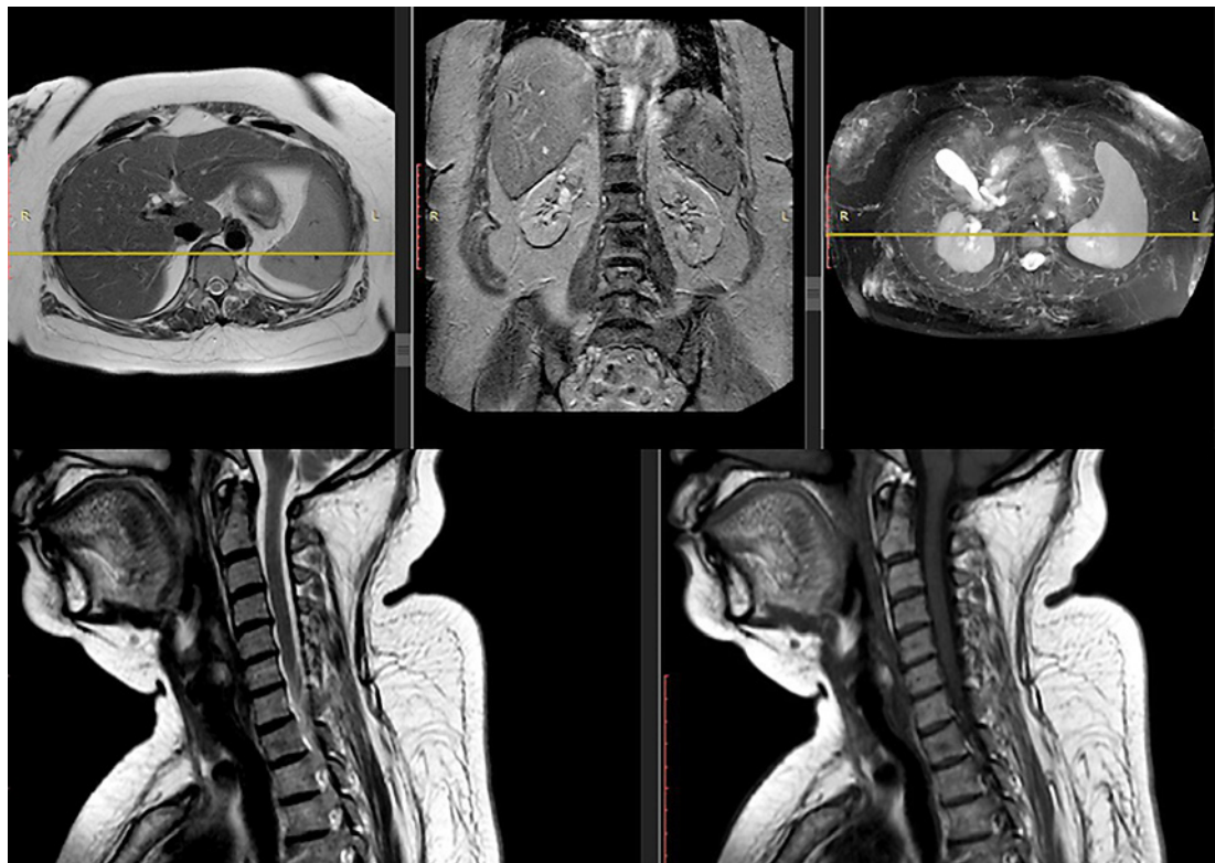
Fig. 3. Whole body CT scan performed 1 month after treatment completion showing no sign of residual lesion.