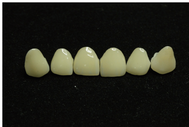
Fig. 4. Final restorations for the maxillary anterior teeth before cementation.