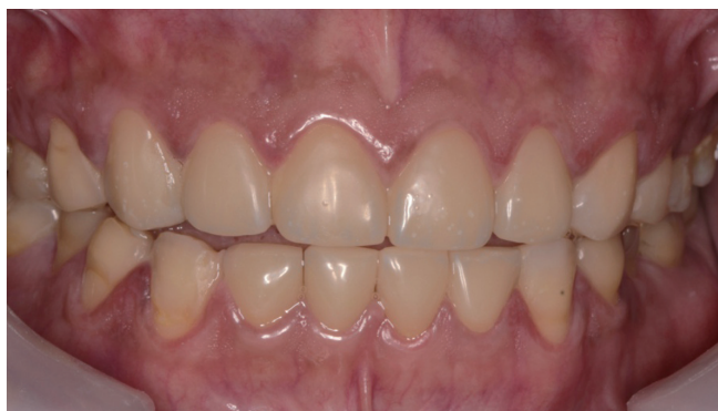
Fig. 5. Postoperative frontal view at maximum intercuspation position.

The patient has been back to swim in a swimming pool with proper chlorination. Esthetics, phonetics, and function were satisfactorily restored. After 6-months follow-up, the restorations were in place with no complications. The periodontal health appeared to be normal. The patient has been maintaining good oral hygiene care of his teeth. Post-treatment monitoring will be followed in every 6 months. Since there have been insufficient clinical report regarding using hybrid ceramic in this type of case, long-term follow-up will be performed for at least 3 years. Further long-term clinical performance will be provided.