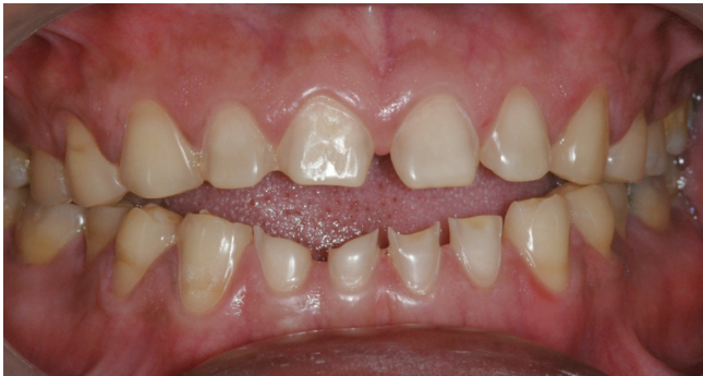
Fig. 1. Preoperative frontal view at maximum intercuspal position.

The treatment goals in this case were to restore the damaged tooth structure and reestablish the esthetics of the smile. Definitive treatment modalities for excessive tooth erosion include direct composite resin restorations, porcelain laminated veneers, and complete coverage crowns.