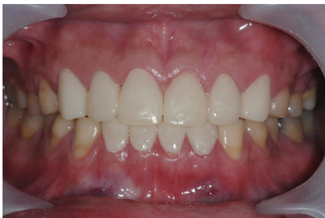
Fig. 3. Direct intra-oral mock-up made from bis-acryl provisional material.

Clinical try-in and adjustment were performed prior to permanent cementation. Comprehensive esthetics, phonetics, and function were evaluated. The occlusion was assessed to eliminate occlusal interferences, especially on the maxillary and mandibular canines. The edge-to-edge occlusal relationship was established in this case to avoid excessive coronal crown height in both maxillary and mandibular anterior teeth. The intaglio surfaces of the restorations were treated with 5% hydrofluoric acid (VITA CERAMICS ETCH, Vita, Zahnfabrik, Germany) for 60 seconds according to the manufacturer's instruction. The etching gel was completely removed using water spray and the restorations were dried for 20 seconds. Silane was applied to the intaglio surfaces of the crowns and dried completely. Self-adhesive resin cement (Rely X Unicem, 3M ESPE, Seefeld, Germany) was used to cement restoration following the manufacturer's recommendations. Excess cement was removed completely and the special care instructions for ceramic restorations were given to the patient (Fig. 5). After completion, the patient's discomfort and tooth sensitivity disappeared.